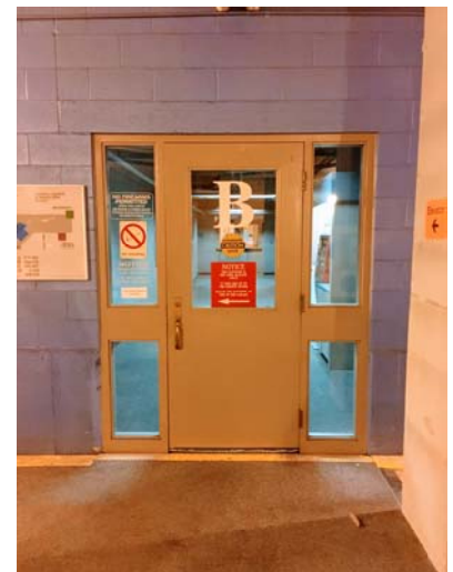
Entrance to Elevators

Please choose “L” (Lobby). The stationed security guard will assist you in arriving to your appointment.